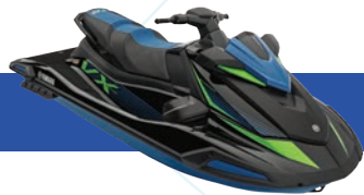
VX ® DELUXE