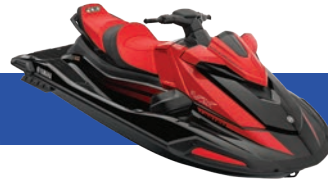
VX ® LIMITED