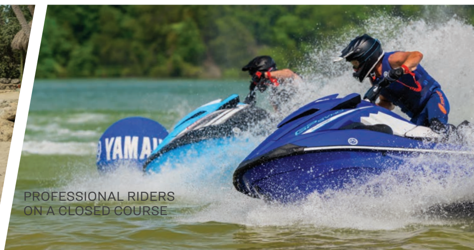
PROFESSIONAL RIDERS ON A CLOSED COURSE