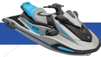
VX ® CRUISER ®