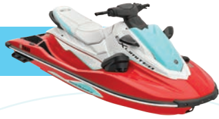
EX ® LIMITED