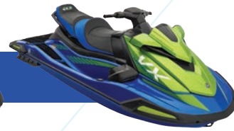
VX ® LIMITED HO