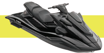
FX ® SVHO ®