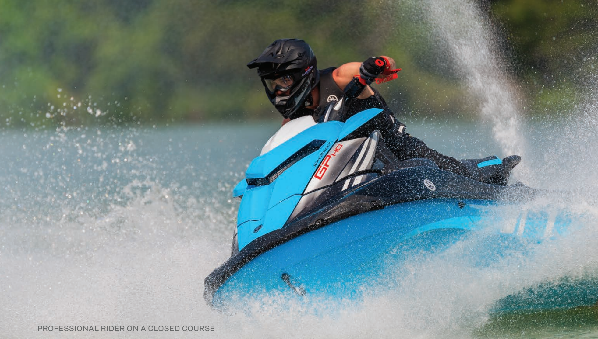
PROFESSIONAL RIDER ON A CLOSED COURSE