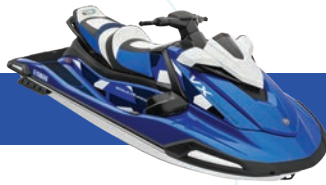
VX ® CRUISER ® HO