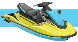
EX ® DELUXE