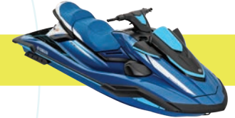
FX CRUISER® HO