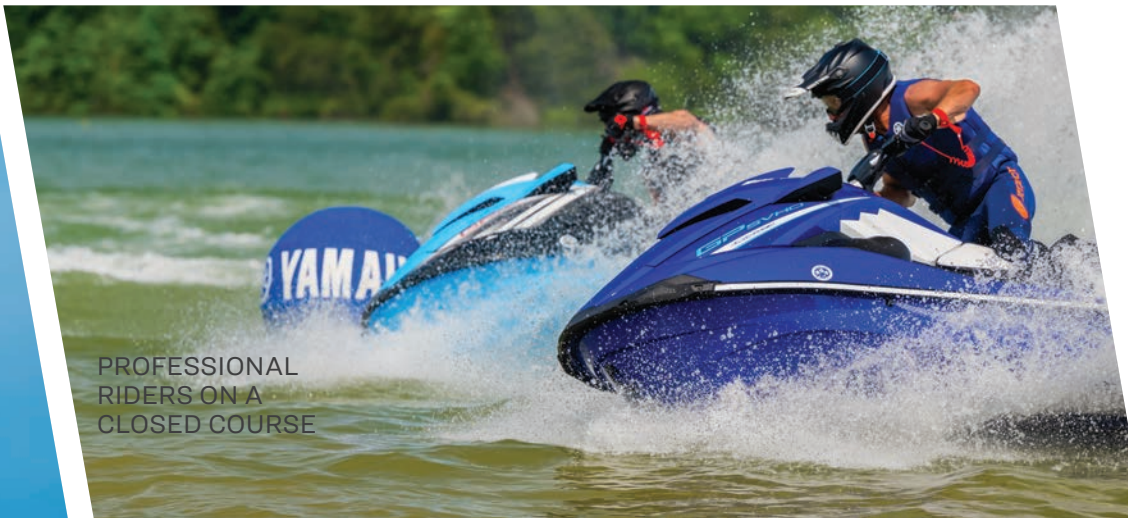
PROFESSIONAL RIDERS ON A CLOSED COURSE

Yamaha is the winningest brand in professional PWC endurance racing history, winning more national and world championships than all other PWC brands combined. This is a testament to Yamaha's focus on reliability, durability, and performance.