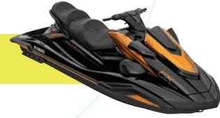
FX ® LIMITED SVHO ®