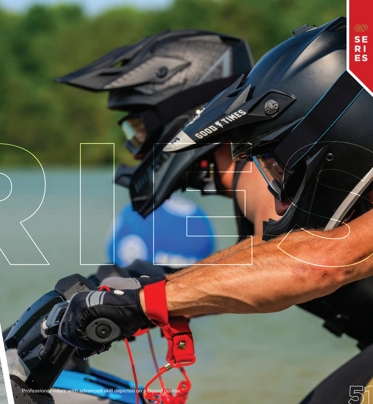
Professional riders with advanced skill depicted on a closed course.