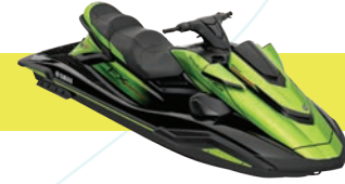
FX ® CRUISER SVHO ®